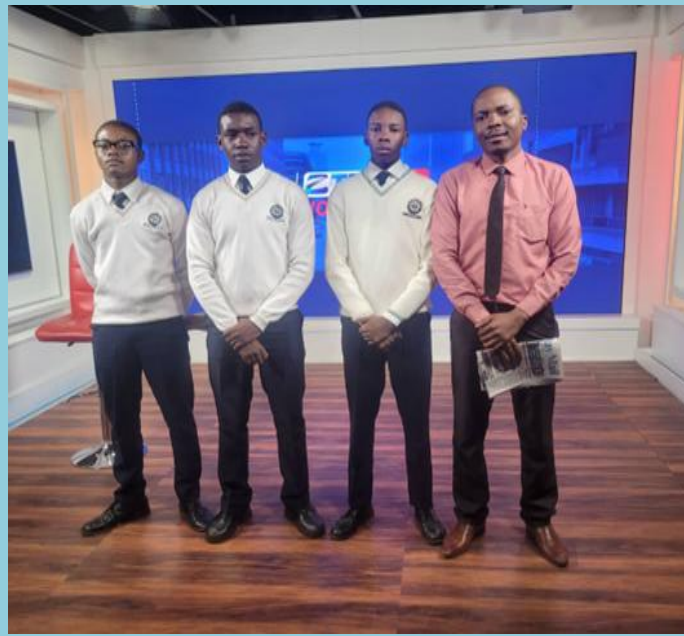
Media enthusiasts from Mother Touch Christian Senior School touring the digital and publishing division.

Our Young Writers Club had an opportunity to visit Zimpapers. The students were appraised among other media issues on the institution's strategy to hit and complete the digital revolution. They also toured Zimpaper Television Network newsroom and studios where they learned about broadcasting technical skills.