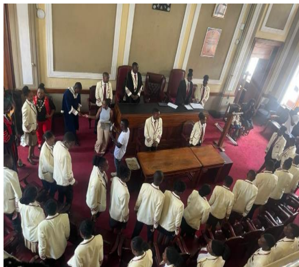
Harare Junior Council Inauguration

Two of our learners were elected into the Harare Junior Council. They were inaugurated as Honourable Junior Councilors for Harare on 23 November 2023 and will serve in the coming year.