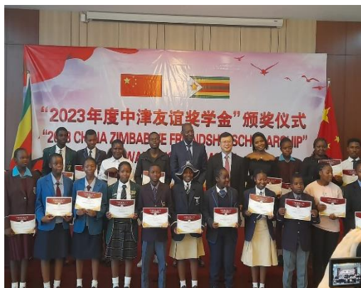
Chinese Scholarship awards ceremony