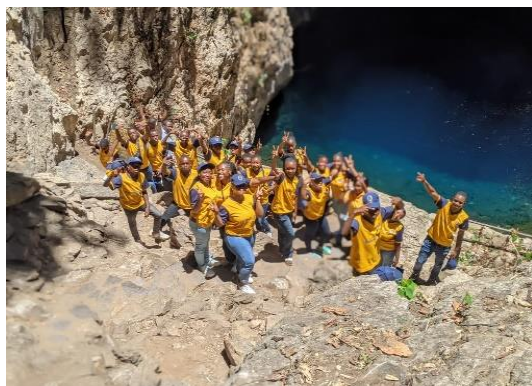
Sport Tourism at Chinhoyi Caves