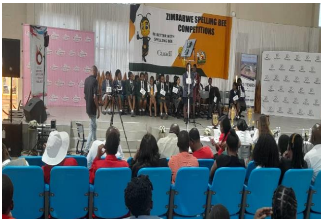
National Spelling Bee Competition

Our learners participated in the National Spelling Bee Competition and reached the quarter finals. 30 schools were represented.