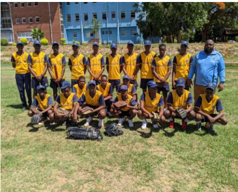
MTSS U16 Baseball Team

Our learners participated in the annual Baseball and Softball Invitational Tournament in Chinhoyi where they came 3 rd and 4 th respectively.