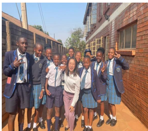
Chinese Teacher with her learners