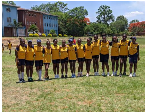
MTSS U16 Softball Team