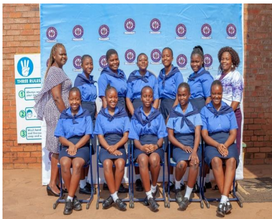
The Rangers Club