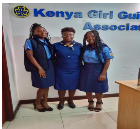
The Rangers in Kenya