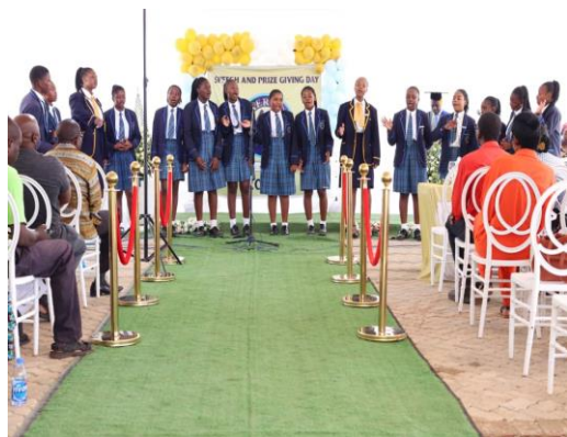
Mother Touch Senior School Selous Speech and Prize giving Day 2023

The prize giving day took place on 25 November 2023. It was a memorable day when parents gathered at the Selous Senior School witnessing the great work that the Lord is doing at the school. Excellent, massive projects are going on with world class infrastructure and sporting facilities.