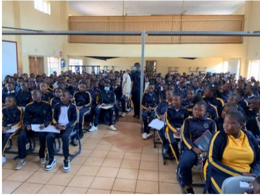
MTSS learners in the financial workshop