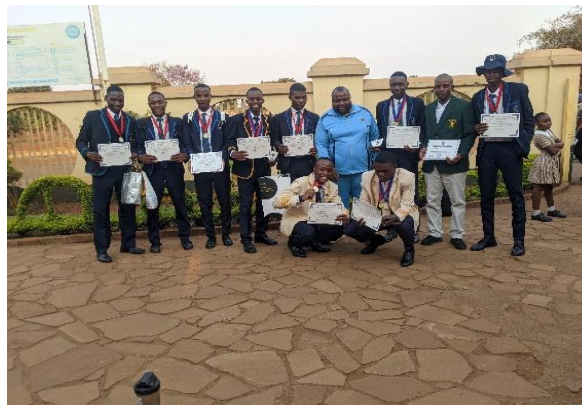
Senior Baseball Team