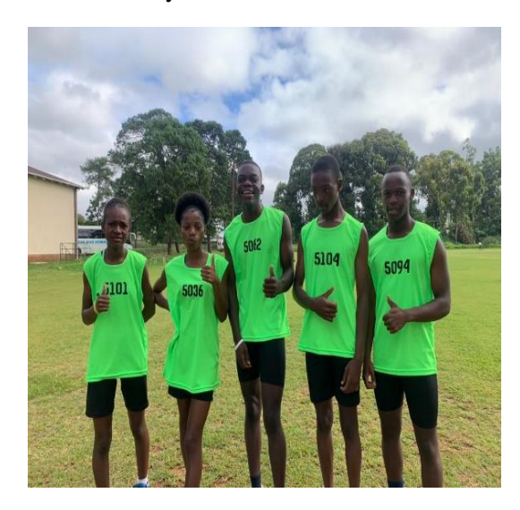
Learners who reached the Provincial level

The school has started preparing for the ball games such as cricket, basketball, soccer and many more. The department has introduced baseball with the hope of having learners qualifying for the national team to travel to Ghana in May.