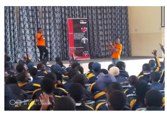
Mubatirapamwe facilitating at MTSS