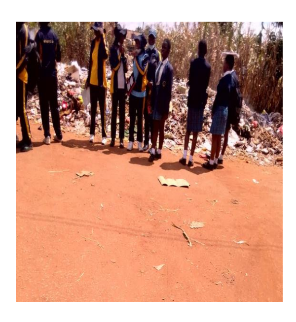
MTSS learners on environmental awareness day

On 29 March 2023, the environmental club carried a research on waste management and pollution, a problem which is affecting Tynwald South. As part of the solution, the club members carried out a campaign concertizing the community on waste disposal practices. The learners interacted with the community and demonstrated how waste materials can be burnt using diesel.