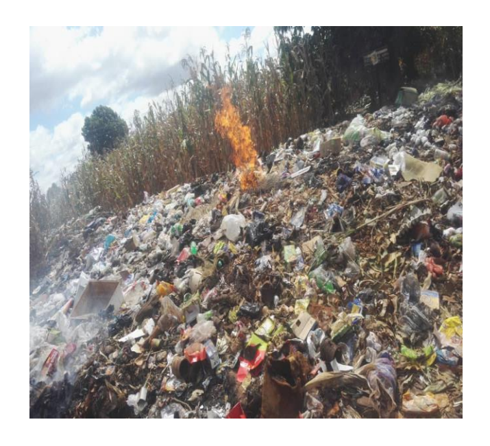
MTSS demonstration of burning litter